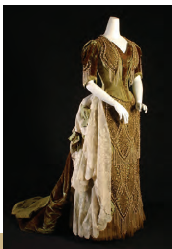
Emile Pasquier, ballgown, 1889–1890, France.

aris has long been regarded as the international capital of fashion. According to The New Yorker , Paris remains, despite competition, "the most glamorous and competitive of the world's fashion capitals." Paris has unquestionably played a very important role in the history of fashion. But Paris has also been mythologized, and this exhibition explores how the "aura" of Paris fashion was constructed over many generations.