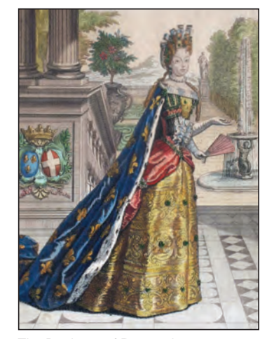
The Duchess of Burgundy. Antoine Trouvian. Paris, circa 1697.