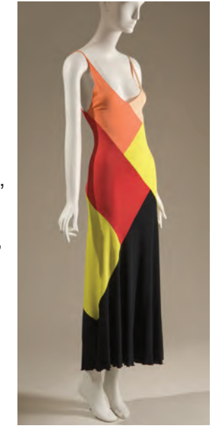
Stephen Burrows, evening dress, 1973, USA.

"the faces, the figures, and the francs."