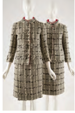
(L) Suit by Gabrielle Chanel, 1966, France, and (R) licensed copy of a Chanel day suit, c. 1967, USA.

The rise of the haute couture was crucially important to the consolidation of Paris as a modern fashion capital. In 1858, when Charles Frederick Worth established his couture house on the Rue de la Paix. Paris was already home to many "little" dressmakers, but Worth created grande (big) couture, which was soon known as haute (high) couture. Elite American women were attracted by the prestige of Paris fashion, and Worth recognized their importance as clients, saying they had