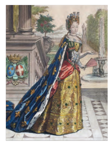
The Duchess of Burgundy. Antoine Trouvian. Paris, circa 1697.