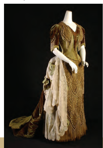
Emile Pasquier, ballgown, 1889–1890, France.

aris has long been regarded as the international capital of fashion. According to The New Yorker , Paris remains, despite competition, "the most glamorous and competitive of the world's fashion capitals." Paris has unquestionably played a very important role in the history of fashion. But Paris has also been mythologized, and this exhibition explores how the "aura" of Paris fashion was constructed over many generations.