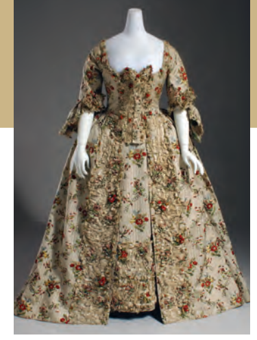
Robe à la française, 1755 – 1760, France.