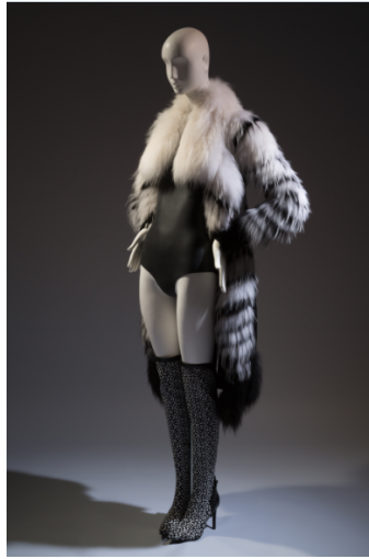
Ohne Titel, coat, fall/winter 2012, bodysuit, spring/summer 2015, boots, fall/winter 2016. USA. Gift of Ohne Titel.