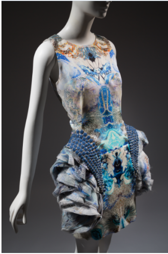
Alexander McQueen, dress, spring/summer 2010, England. Collection of the Honorable Daphne Guinness.