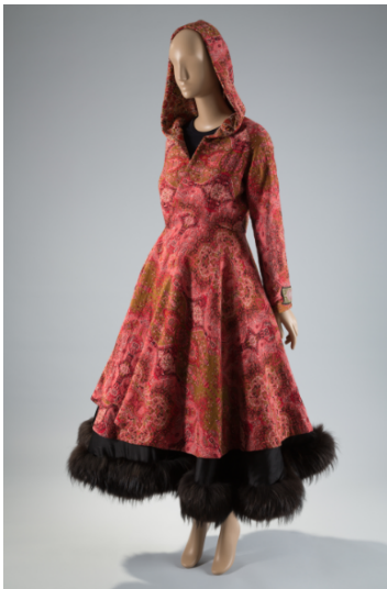
Yohji Yamamoto, ensemble, fall/winter 2000, Japan.

Extreme mountain climbing is represented by another of the primary environments. Here, the earliest patented down-filled jacket by Eddie Bauer, dating to the 1930s, and other technologically experimental objects, stand alongside a range of fantastic and outrageous fashions, including Charles James's 1938 masterpiece: a white silk satin, eider-down-filled evening jacket on loan from the Victoria and Albert Museum. Also included are Norma Kamali's revolutionary "sleeping bag coat," dating to the late 1970s, and down-filled "puffer" jackets by Junya Watanabe, and Gemma Dvesalia for Balenciaga.