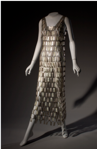
Paco Rabanne, wedding dress, circa 1968, France. Gift of Montgomery Ward.

The fourth and final environment of Expedition is a lunar landscape. The futuristic, astral moon setting is enlivened with an array of bright and light 1960s fashions by Parisian couturiers, such as Pierre Cardin, André Courrèges, and Paco Rabanne, and American designers, such as Betsey Johnson for Paraphernalia. Several objects with silver, shiny, reflective surfaces were made using materials inspired by Mylar, rather than actual Mylar film. Together, these fashions illustrate the impact of the Space Race between the United States and the Soviet Union that dominated the political and cultural arenas from the 1950s to the early 1970s. Later space-inspired designs by Helmut Lang and Hussein Chalayan round out this section.