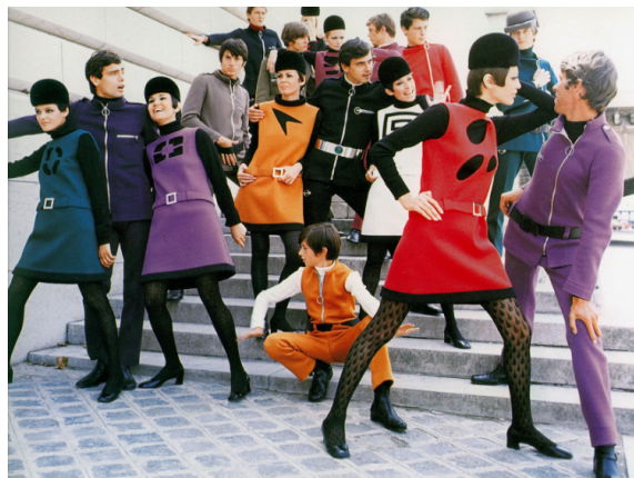
Pierre Cardin, Cosmocorps collection, 1967.