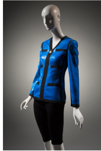
Chanel, jacket, spring/summer 1991, France.

The fourth and final environment of Expedition is a lunar landscape. The futuristic, astral moon setting is enlivened with an array of bright and light 1960s fashions by Parisian couturiers, such as Pierre Cardin, André Courrèges, and Paco Rabanne, and American designers, such as Betsey Johnson for Paraphernalia. Several objects with silver, shiny, reflective surfaces were made using materials inspired by Mylar, rather than actual Mylar film. Together, these fashions illustrate the impact of the Space Race between the United States and the Soviet Union that dominated the political and cultural arenas from the 1950s to the early 1970s. Later space-inspired designs by Helmut Lang and Hussein Chalayan round out this section.