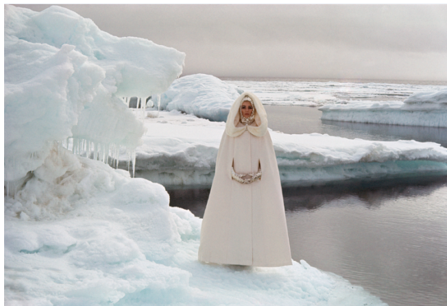
Photograph by John Cowan, 1964 © The John Cowan Archive

The Museum at the Fashion Institute of Technology (MFIT) presents Expedition: Fashion from the Extreme (September 15–January 6, 2018), the first large-scale exhibition of high fashion influenced by clothing made for survival in the most inhospitable environments on the planet—and off of it. On view in Expedition are approximately 70 ensembles and accessories from MFIT's permanent collection, as well as a compelling selection of objects borrowed from leading museums and private collections. These garments are presented within dramatically designed “environments” in the museum's Special Exhibitions Gallery. Collectively, the objects and the exhibition design evoke both the beauty of extreme wildernesses—on land and sea, as well as in outer space—and the dangers these locales present to human explorers.