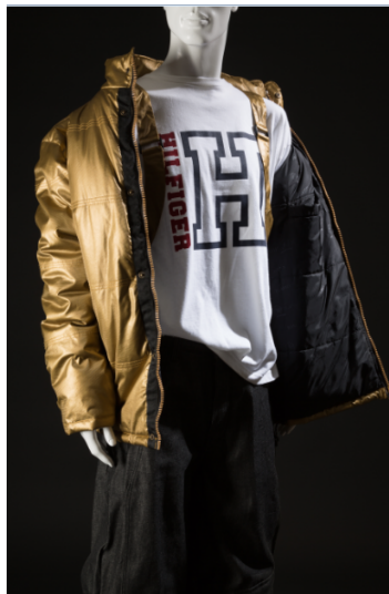
Tommy Hilfiger, man's ensemble, 1999, USA. Gift of Tommy Hilfiger USA.