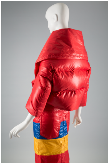
Junya Watanabe, Comme des Garçons, ensemble, fall/winter 2004, Japan.

Likewise tracing the progression from strictly utilitarian to fashionable, the exhibition presents an array of down-filled “puffer” coats—perfected for extreme mountain climbing—that includes opulent, high-fashion versions created strictly for show. Experimental, high-tech materials, such as neoprene and Mylar, initially developed for deep sea and outer space exploration, have also made their way onto the world’s most exclusive runways and into this exhibition.