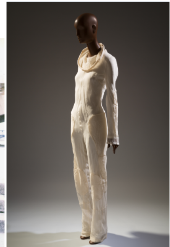
Helmut Lang, jumpsuit, fall/winter 1999, USA. Gift of HL – art.