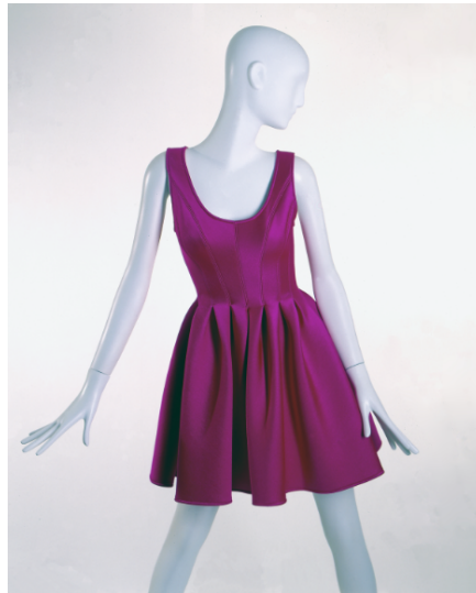
DKNY, dress, 1994, USA. Gift of DKNY.