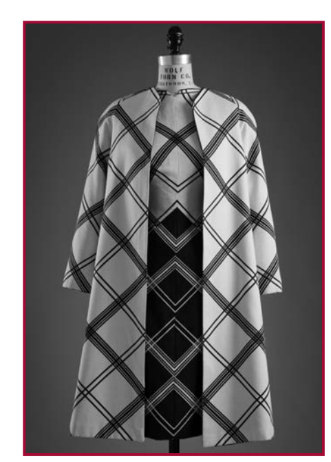
Pauline Trigère, cloqué dress and coat, navy blue and white cotton, circa 1964, USA, lent by Beverley Birks.

merican Beauty explores innovative clothing construction in the United States. The goal of the exhibition is to demonstrate that the work of American fashion designers has been groundbreaking—not limited, as is sometimes assumed, to the production of casual and functional clothing such as denim jeans and sportswear. The exhibition covers the period from the 1930s to the present, and it focuses on the relationship between the technical aspects of modern dressmaking in the United States and aesthetics, or the "philosophy of beauty." The interdependence of technique and beauty is evident in the work of a group of American fashion designers—selected especially for this exhibition—who have created a broad spectrum of clothing types, from highly innovative yet affordable readyto-wear to luxurious and exacting couture.