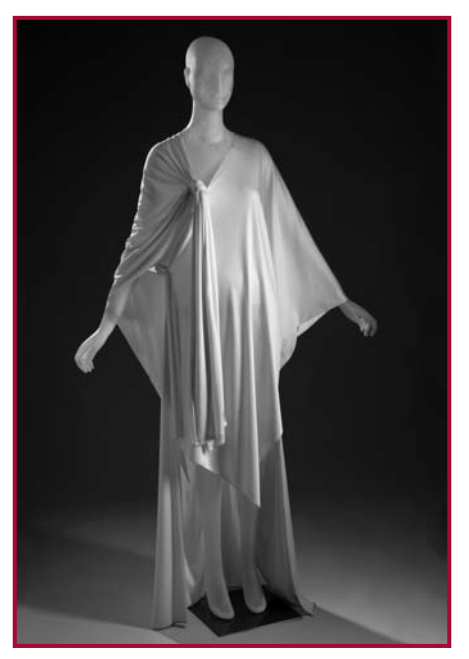
Charles Kleibacker, evening caftan dress, white nylon jersey, 1969, USA, gift of Charles Kleibacker.

Just as there is no single "American" style, there is no typical American designer. Most of the designers chosen for American Beauty come from every corner of the