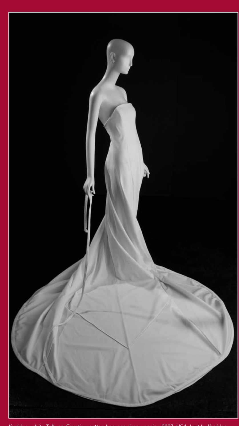
Yeohlee, white Teflon® Egyptian cotton harness dress, spring 2007, USA, lent by Yeohlee.