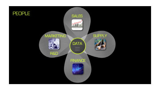
Figure 4: Data-Centric Organization

While 2020 holds groundbreaking possibilities, Big Data can affect the beauty industry right now. Today, 93% of beauty organizations do not have a data-dedicated function (Meerman Scott, 2009). Data is often generated and disseminated within the sales and finance teams, instead of cross-pollinating