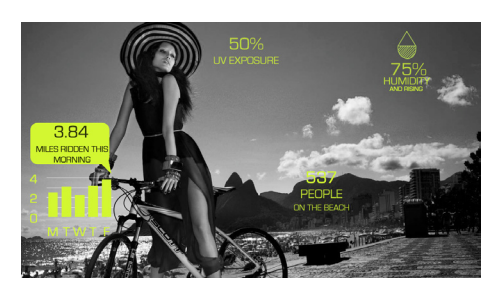
Figure 2: The Internet of Things