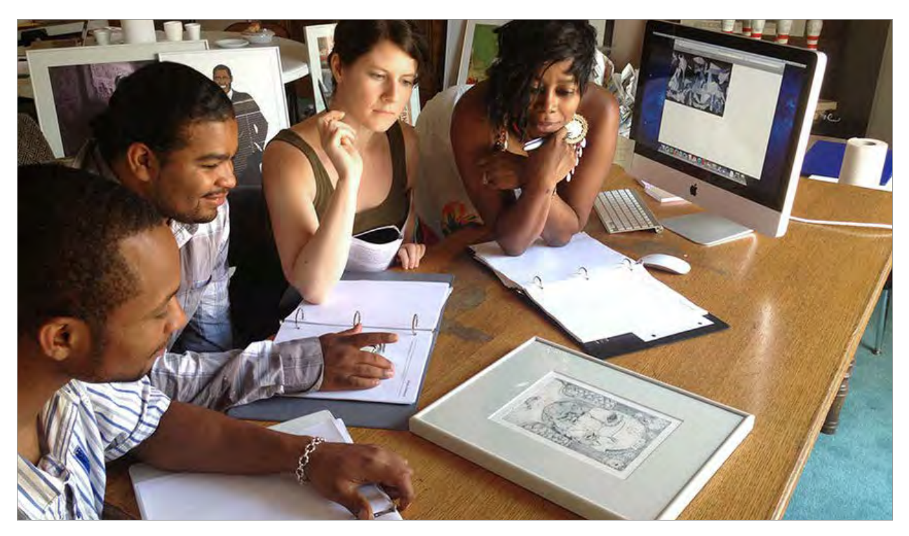
Art Lending Collection facilitators at the Braddock Carnegie Library, 2013.

MUSEUM: Carnegie Museum of Art, Pittsburgh, PA PARTNER: Transformazium/Braddock Carnegie Library When One Thing Leads to Another, A Partnership Becomes a Relationship