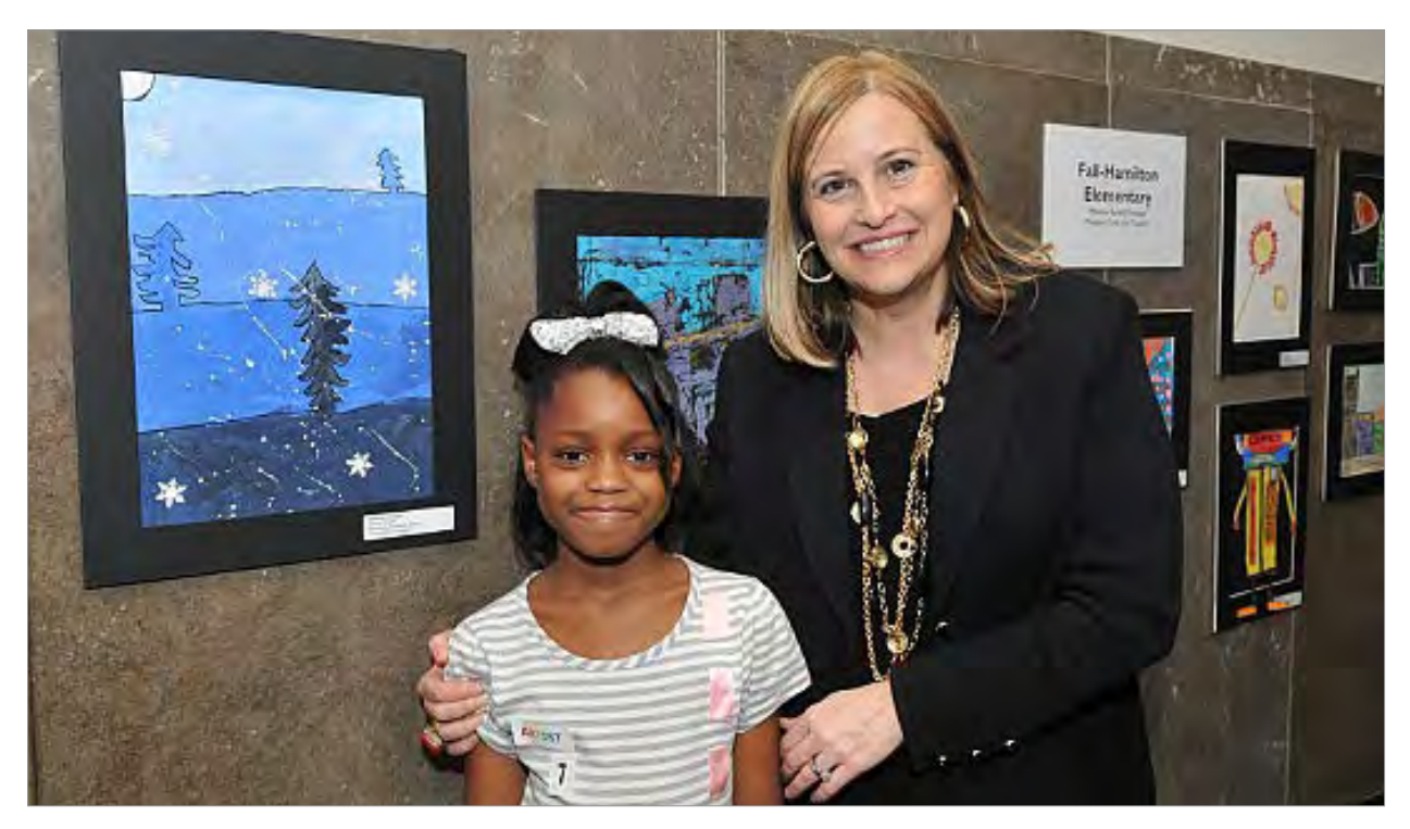
Frist Center for the Visual Arts, Nashville. Metropolitan Nashville Public School elementary student with Nashville Mayor Megan Berry at the Mayor's Art Show, 2016.

ach year, the Frist Center exhibits art by over 1,500 area K-12 students in a series of eight exhibitions that highlight the accomplishments of students in the Metro Nashville Public Schools (MNPS) and the public school systems in the surrounding counties. The public school art teachers select the student artwork, allowing them to highlight the creative accomplishment of students who may not be recognized otherwise. Many students and families coming to the opening reception are visiting a museum for the time. While here, they also see the exhibitions on view at the Frist Center. The series of school systems student art shows grew out of the Mayor's Art Show, created by Metro Nashville Mayor Phil Bredesen over twenty years ago. In 2004, the Frist Center began hosting the Mayor's Art Show, which has continued through the administrations of three subsequent mayors