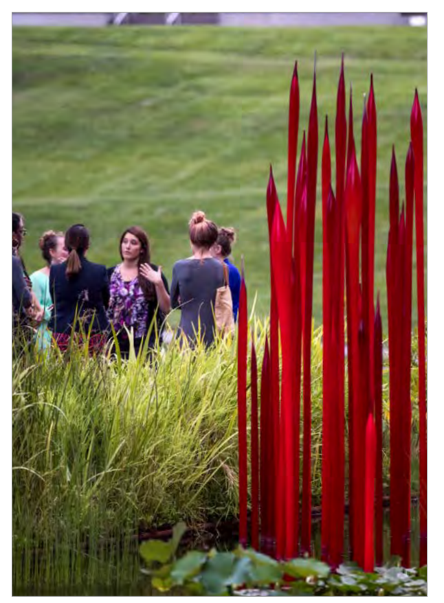
Art of Nursing students in VMFA's sculpture garden.