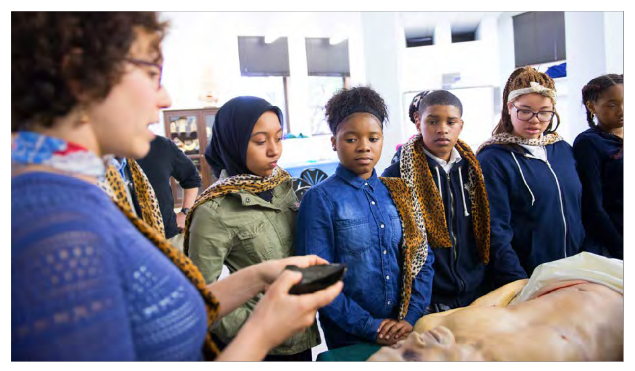
Philadelphia public school students learn the process of mummification from start to finish during a Mummy Makers workshop.

npacking the Past brings the <u>University of Pennsylvania Museum of Archaeology and Anthropology's</u> (Penn Museum's) spectacular collections of ancient art and architectural works to life for Philadelphia middle school students, by exploring curriculum through vividly imagined scenarios in the ancient world. The program engages students through multiple encounters: in-school presentations, guided gallery tours, hands-on workshops, and special events that invite students and their families to become better acquainted with their local museum about human diversity—a cultural resource we hope may become a lifelong source of information, entertainment, and belonging.