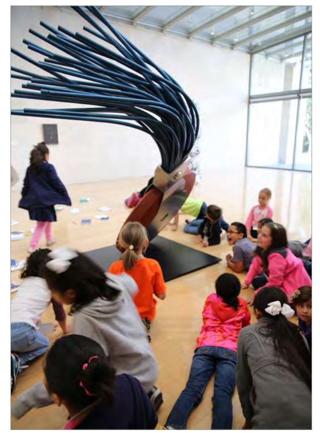
GROW students admiring the balance and details of Claes Oldenburg's Typewriter Eraser .