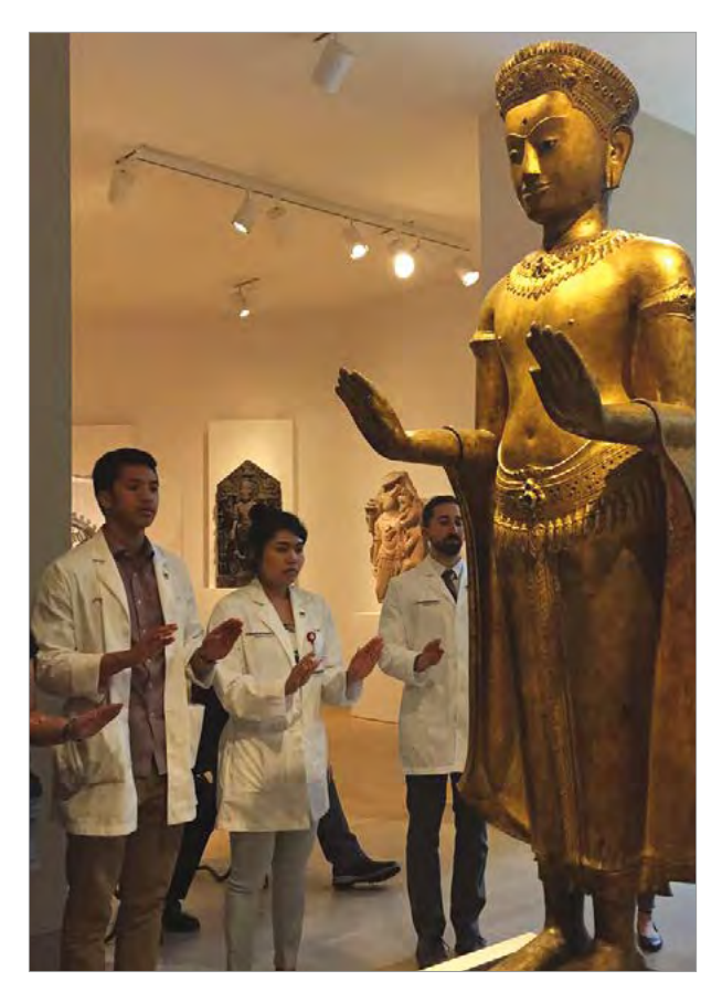
Focusing on medical student burnout through close looking and meditation in the galleries.

he <u>Dallas Museum of Art (DMA)</u> collaborates with the <u>University of Texas</u> <u>Southwestern Medical School</u> and the <u>Edith</u> <u>O'Donnell Institute of Art History at the University</u> <u>of Texas at Dallas</u> to engage medical students in observing, analyzing, and communicating about works of art to develop their diagnostic skills.