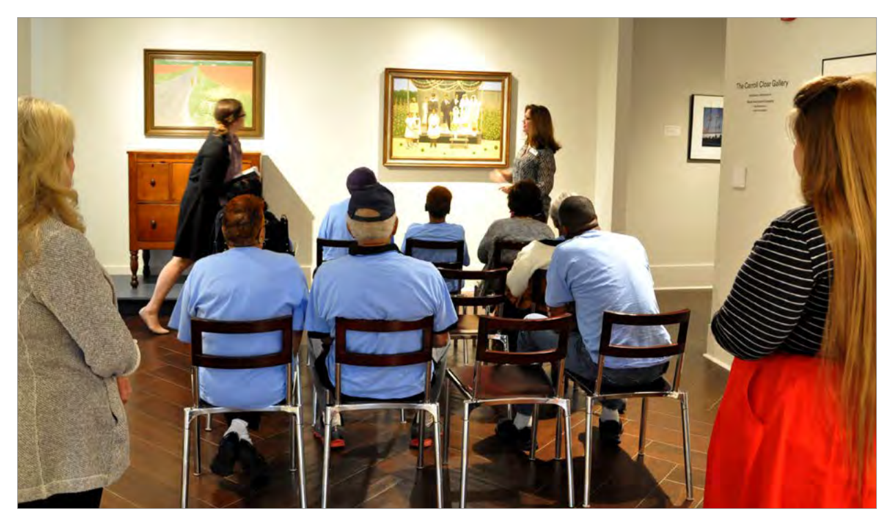
Seniors from Alzheimer's and Dementia Services of Memphis participate in gallery discussions at the Memphis Brooks Museum of Art, while art therapy students from Christian Brothers University observe.

he Art Therapy Access Program (ATAP) at the Memphis Brooks Museum of Art provides art therapy and educational partnerships and experiences that promote mental and emotional health, enhance personal wellbeing, and deepen community relationships through visual art. The Brooks has been among the few organizations and settings in the Mid-South to consistently offer art therapy for the past 10 years. In that time, the Art Therapy Access Program has worked with people of all ages, serving more than 750 people through partnerships with over 15 organizations. The program is designed to provide a supportive, creative, environment and experience for participants to develop and explore their strengths and personal narratives through art-making, gallery explorations, and group discussions.