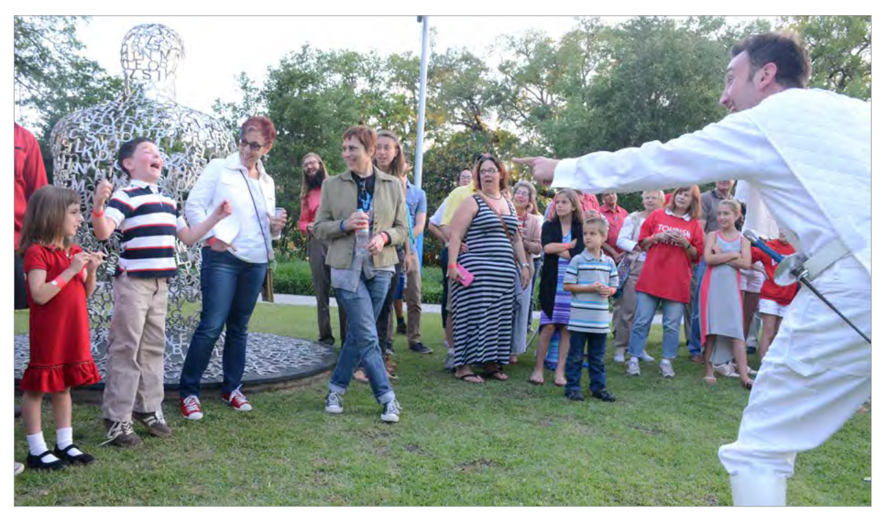
The NOLA Project at NOMA, Adventures in Wonderland, 2014.