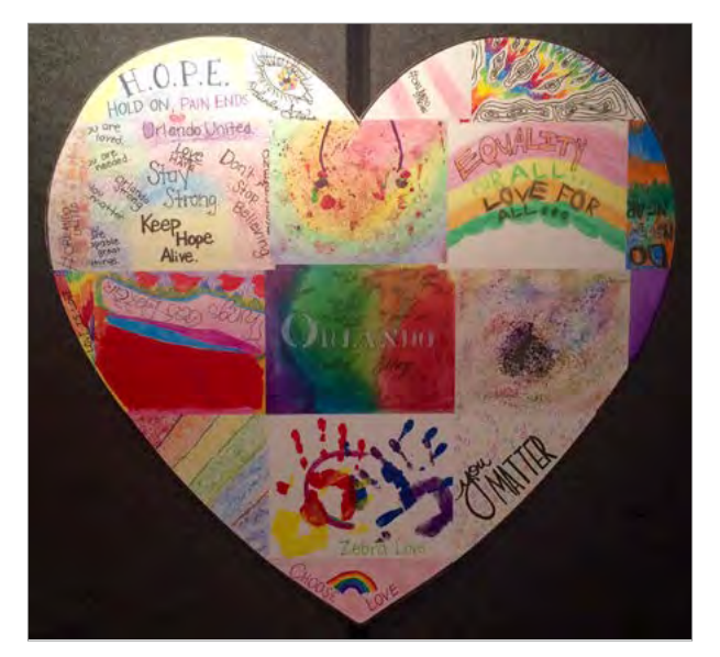
This work was developed after the tragedy at Pulse nightclub on June 12, 2016. Each youth received an individual portion of the heart installation with the instruction to provide a message of hope for the Orlando community.