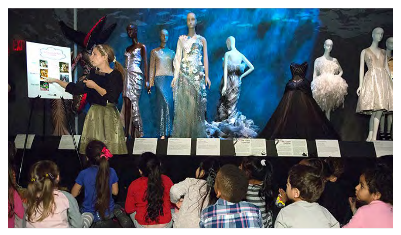
Fairy Tale Fashion School Program.

uring February and March of 2016, The Museum at FIT (MFIT) partnered with Chelsea Prep elementary school (P.S. 33) to develop a program in which students learned to identify special types of garments seen in fairy tales and characteristics of "fairy tale" fashions. Students also created their own "fairy tale fashion" mini mannequin. The program concluded with a visit to MFIT's exhibition Fairy Tale Fashion , during which students participated in a scavenger hunt to find the types of garments seen and discussed in the classroom. The curriculum for this program is a collaborative effort, developed with the classroom teachers at Chelsea Prep in order to best serve their educational needs.