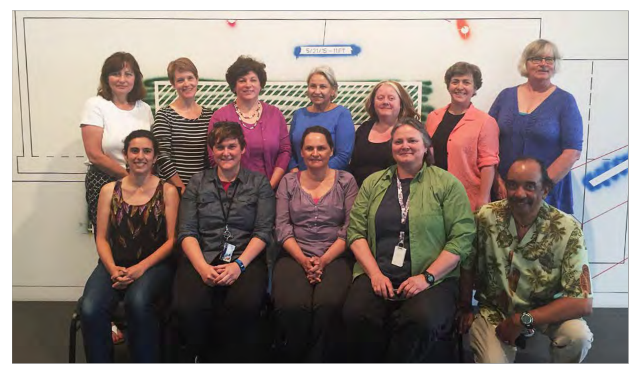
2015-16 Educator Advisory Board at the Colby College Museum of Art.

n the fall of 2015, the Colby College Museum of Art recruited eleven area teachers to join the museum's first Educator Advisory Board.