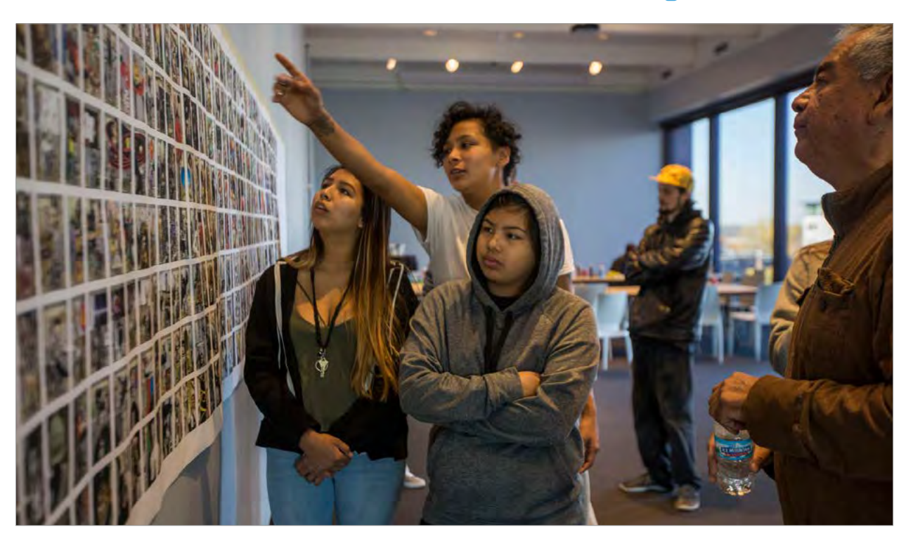
Youth from the Little Earth Arts Collective interview Frank Big Bear about his collage "Multiverse #10."

n conjunction with the launch of a newly commissioned, 40-foot wall work for the entrance of the Walker Art Center by Frank Big Bear, the Walker Art Center partnered with the Little Earth of United Tribe Arts Collective for a 12-week career readiness series that culminated in tours and talks about the artwork. This series created the opportunity for 15 youth from the Little Earth community to gain work-readiness and career building skills through music, visual art, and performance workshops.