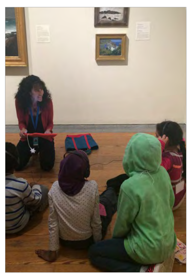
Students with a docent during a visit. This activity had students use an iPad to listen to various ocean sounds.