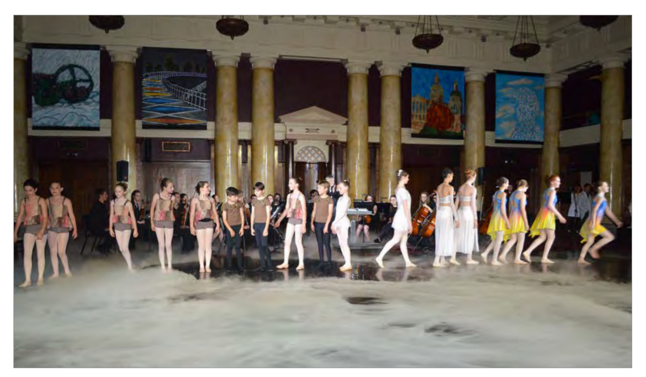
Youth performers and student murals from inaugural Four Seasons performance.

III CULTURAL ORGANIZATIONS OR SCIENCE CENTERS