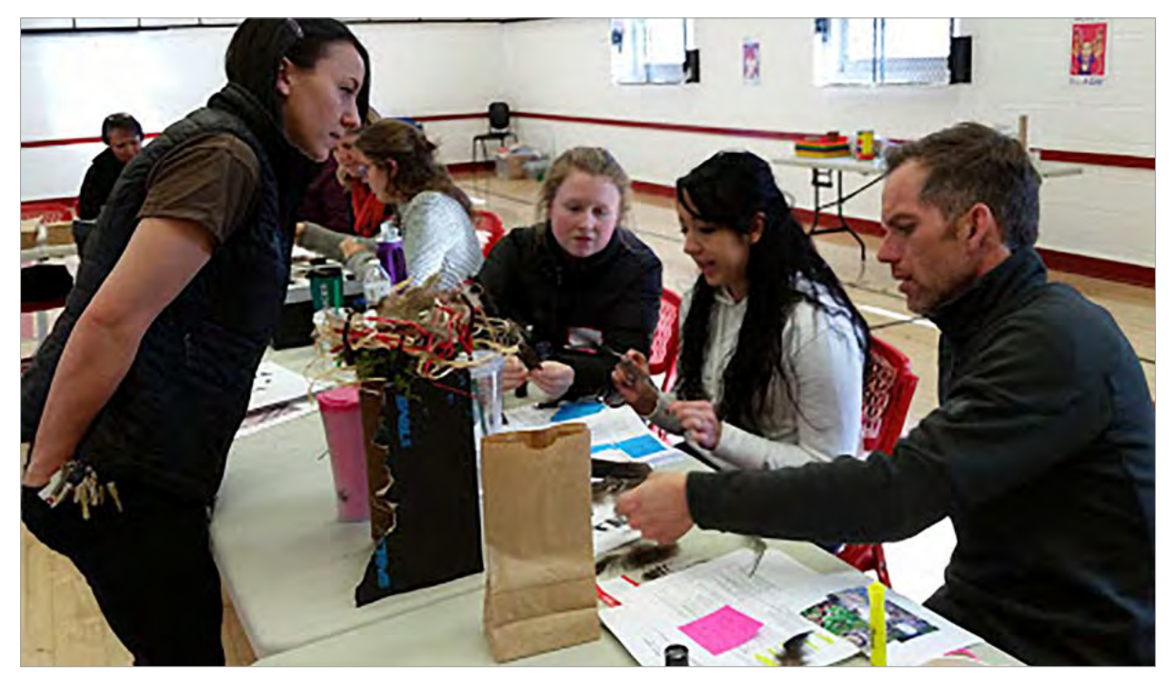
III CULTURAL ORGANIZATIONS B SCIENCE CENTERS