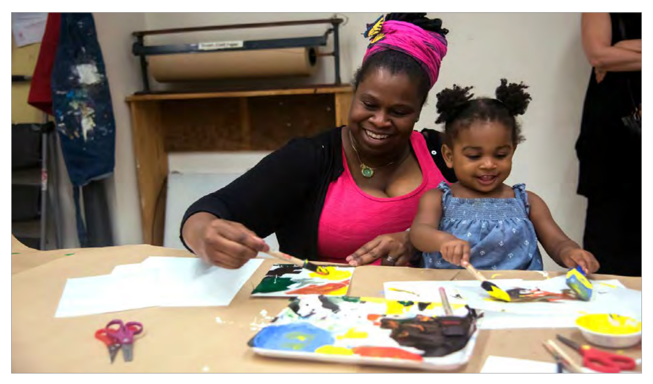
Family fun at the Brooklyn Museum.

ighteen years ago, families with children under the age of four had very few options at cultural institutions. While many museums were stroller friendly, very few organizations beyond children's museums offered programs or resources. Enter <u>Cool Culture</u>, an organization founded in 1999 to build bridges between families with children enrolled in preschools and Title 1 pre-K and kindergarten classes, and cultural institutions. Cool Culture quickly determined that diverse early childhood families were disproportionately affected by a lack of access to cultural institutions. Enter the <u>Brooklyn Museum</u>, with a history of serving diverse audiences through education for over 100 years. The partnership began with free access for thousands of families to the Brooklyn Museum, as well as other cultural institutions throughout New York City, via the Cool Culture Family Pass.