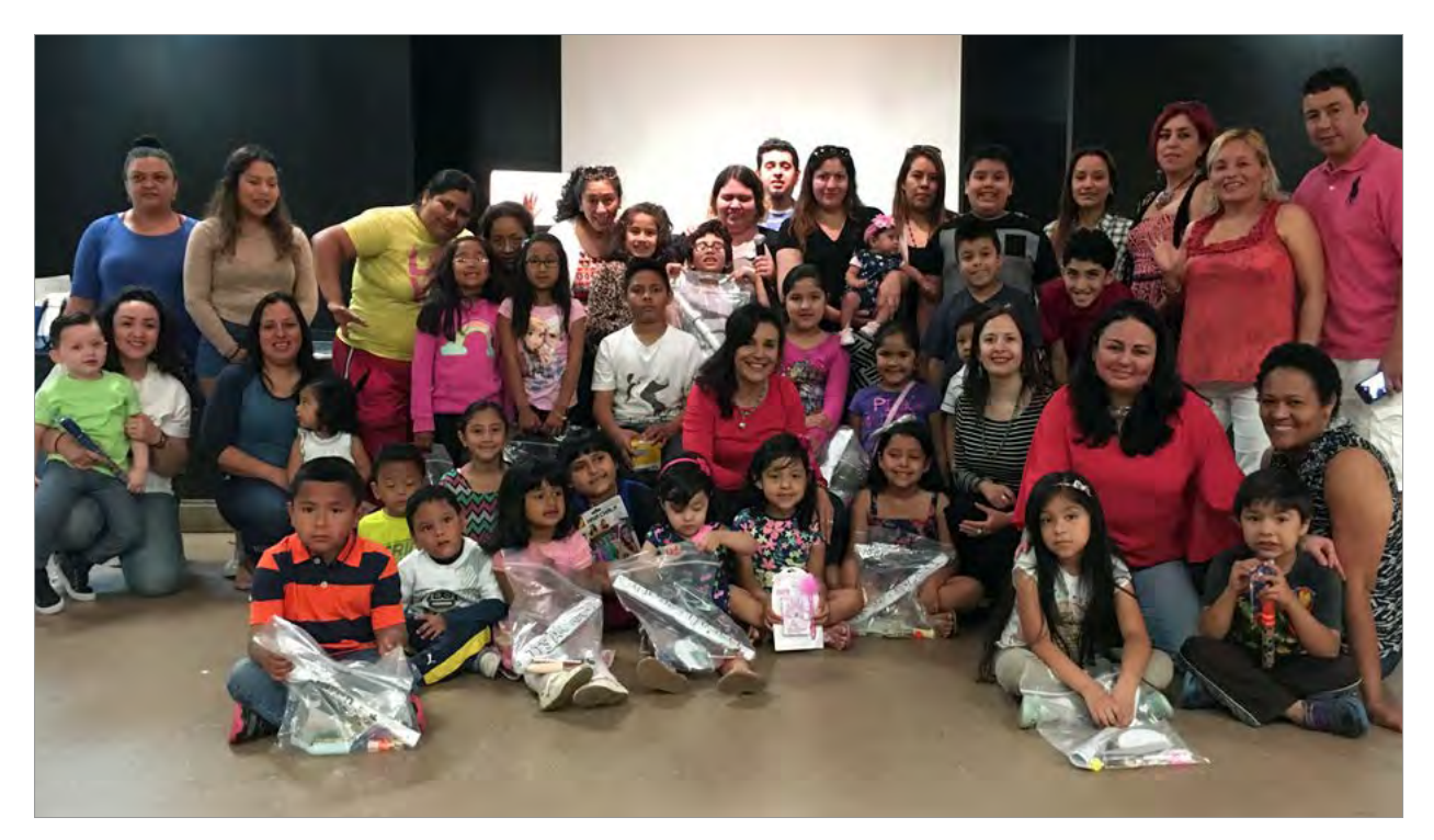
Bilingual Stories & Music on Wheels at Camino Community Center in 2016.

n 2012, The Mint Museum launched a museum-wide Latino initiative. Building upon the Mint's nearly 20-year history of participation and engagement with Charlotte's growing Latino population, the initiative has expanded to include partnerships with several local organizations that serve the Latino community.