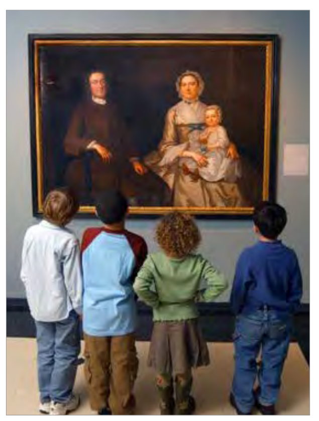
Viewing Art, Seeing America, Newark Museum