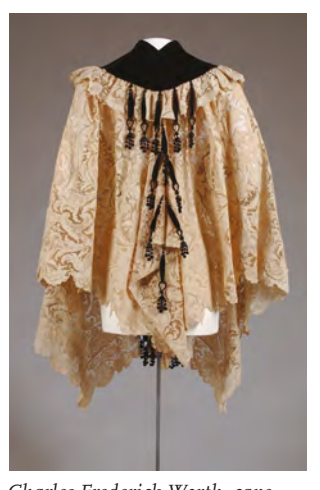
Charles Frederick Worth, cape, lace, circa 1890, France.

luxurious fabrics, fashioned a circa 1890 evening cape from eighteenth-century lace. A 1966 jumpsuit designed and worn by Betsey Johnson takes a more colorful approach: it was cleverly remade from rugby shirts worn by her then-partner, musician John Cale. By the 1990s, repurposing was often used to make a statement about overconsumption and obsolescence in fashion.