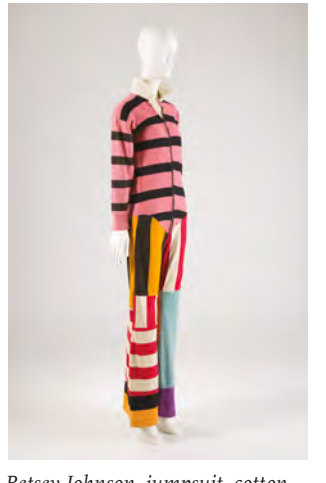
Betsey Johnson, jumpsuit, cotton jersey, 1966, USA.