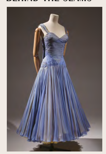
Jean Dessès, evening gown, silk chiffon, 1956, France.

Clothing brought into The Museum at FIT collection sometimes arrives with tales about its maker, its wearer, or its historical significance. While these anecdotes are documented in the museum's database, curators usually do not reference them when a garment is displayed. Such stories are not always evident in an object's appearance. A 1956 evening gown by Jean Dessès is a stunning example of the couturier's work, but the information provided by its donor is also of note. The gown was gifted by Lady Arlene Kieta, one of Dessès's models, who disclosed to the museum that it was made from 66 yards of chiffon fabric and cost $15,000 at the time of its creation.