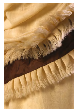
Dress, wool and silk taffeta, circa 1880, USA; and detail.