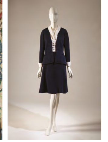
Chanel, suit, double knit wool, circa 1935. France.