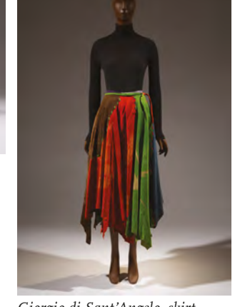
Giorgio di Sant'Angelo, skirt, 1968–69, USA.

Giorgio di Sant'Angelo fashioned garments from bleached, irregularly stitched panels of suede during the late 1960s. By the early 1980s, Rei Kawakubo's work for her label Comme des Garçons took those ideas to a new extreme: a black knit T-shirt was intentionally faded, and its asymmetrical pieces were haphazardly assembled, leaving gaps and unfinished