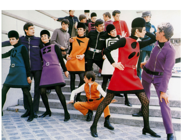
Pierre Cardin, Cosmocorps collection, 1967.