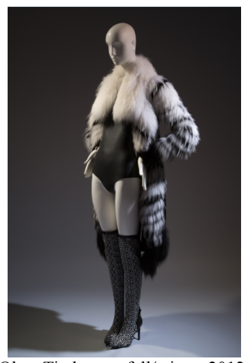
Ohne Titel, coat, fall/winter 2012, bodysuit, spring/summer 2015, boots, fall/winter 2016. USA. Gift of Ohne Titel.