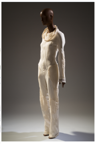
Helmut Lang, jumpsuit, fall/winter 1999, USA. Gift of HL – art.