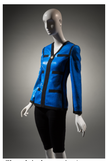
Chanel, jacket, spring/summer 1991, France.

The fourth and final environment of Expedition is a lunar landscape. The futuristic, astral moon setting is enlivened with an array of bright and light 1960s fashions by Parisian couturiers, such as Pierre Cardin, André Courrèges, and Paco Rabanne, and American designers, such as Betsey Johnson for Paraphernalia. Several objects with silver, shiny, reflective surfaces were made using materials inspired by Mylar, rather than actual Mylar film. Together, these fashions illustrate the impact of the Space Race between the United States and the Soviet Union that dominated the political and cultural arenas from the 1950s to the early 1970s. Later space-inspired designs by Helmut Lang and Hussein Chalayan round out this section.