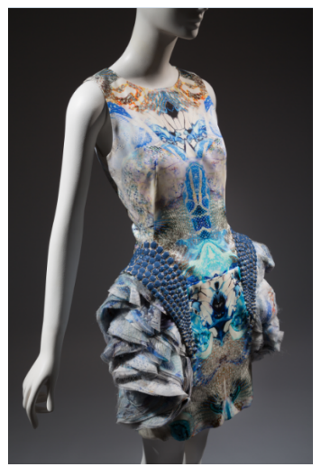
Alexander McQueen, dress, spring/summer 2010, England. Collection of the Honorable Daphne Guinness.