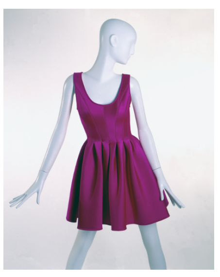
DKNY, dress, 1994, USA. Gift of DKNY. © The Museum at FIT