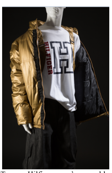
Tommy Hilfiger, man's ensemble, 1999, USA. Gift of Tommy Hilfiger USA.