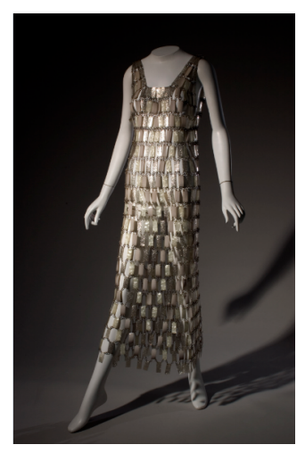
Paco Rabanne, wedding dress, circa 1968, France. Gift of Montgomery Ward.

The fourth and final environment of Expedition is a lunar landscape. The futuristic, astral moon setting is enlivened with an array of bright and light 1960s fashions by Parisian couturiers, such as Pierre Cardin, André Courrèges, and Paco Rabanne, and American designers, such as Betsey Johnson for Paraphernalia. Several objects with silver, shiny, reflective surfaces were made using materials inspired by Mylar, rather than actual Mylar film. Together, these fashions illustrate the impact of the Space Race between the United States and the Soviet Union that dominated the political and cultural arenas from the 1950s to the early 1970s. Later space-inspired designs by Helmut Lang and Hussein Chalayan round out this section.