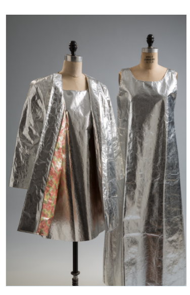
Waste Basket Boutique by Mars of Asheville, dresses, circa 1966, USA. Gift of Ruth Ford and Mrs. D.J. White. Coat, 1966, USA. Gift of Montgomery Ward. © The Museum at FIT

In Expedition 's introductory gallery, a diorama depicting the plains of the Serengeti serves as a backdrop for a range of safari clothing. Safaris were the first expedition destinations to be marketed specifically to the well-heeled traveler, and the clothing created for these excursions would influence fashion designers for decades. A juxtaposition of ensembles—from a circa 1916 women's safari suit by Abercrombie and Fitch to safari-inspired tunics designed by Yves Saint Laurent during the late 1960s—illustrates the enduring popularity of early expedition wear.