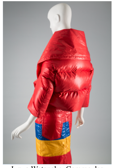
Junya Watanabe, Comme des Garçons, ensemble, fall/winter 2004, Japan.

Likewise tracing the progression from strictly utilitarian to fashionable, the exhibition presents an array of down-filled "puffer" coats—perfected for extreme mountain climbing—that includes opulent, high-fashion versions created strictly for show. Experimental, high-tech materials, such as neoprene and Mylar, initially developed for deep sea and outer space exploration, have also made their way onto the world's most exclusive runways and into this exhibition.