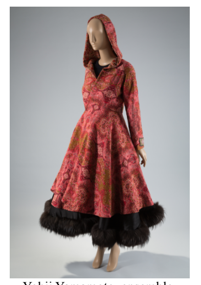
Yohji Yamamoto, ensemble, fall/winter 2000, Japan.