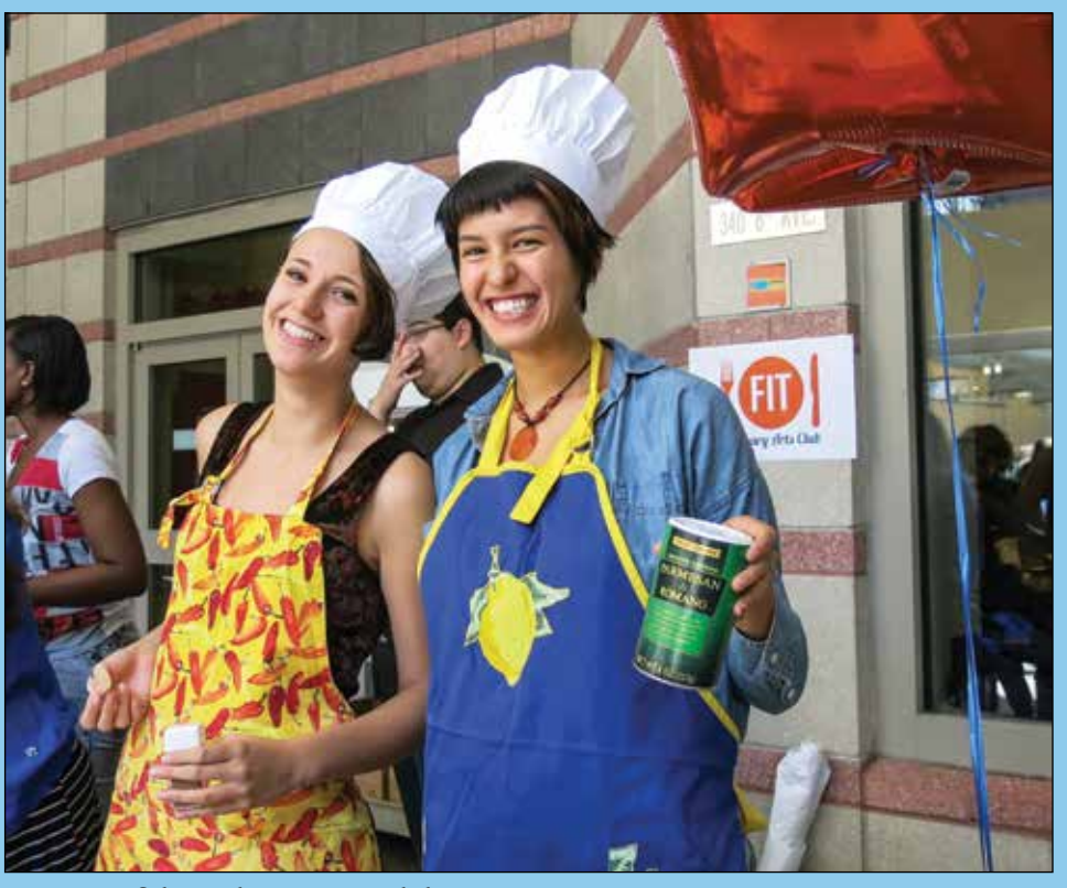
Memers of the Culinary Arts Club

To join students for prayer and friendship, to work together for a better cause (community service), and to grow in spirit (retreats).