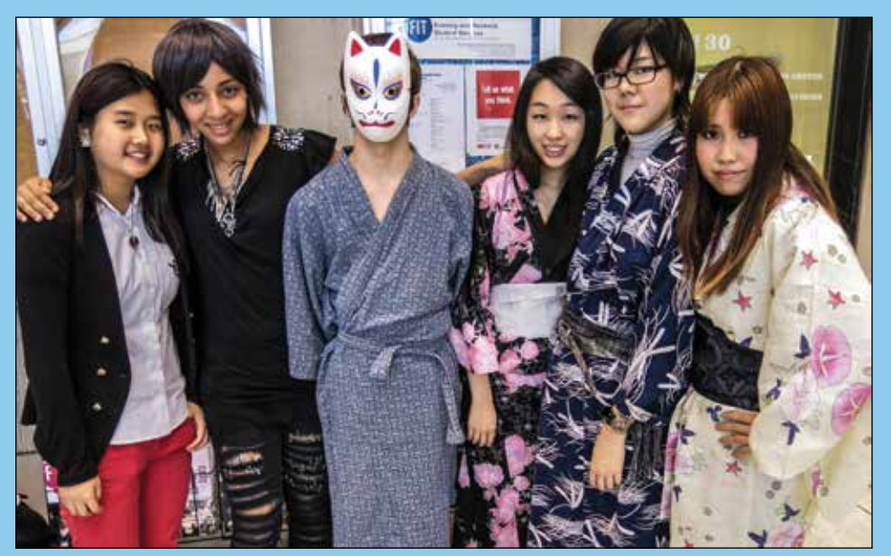
Members of the Anime Club