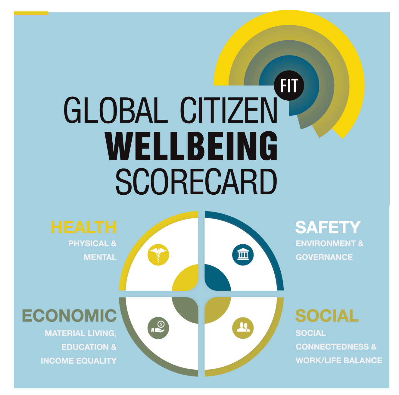
Figure 2. Fashion Institute of Technology Global Citizen Well-Being Scorecard.

measure utilized in the scorecard, a corresponding existing index was chosen that reflected bestin-class measurement and the most comprehensive national ranking system available. By identifying the nations that perform best on these indexes, the scorecard is able to highlight government policies that best support well-being and make global recommendations. Through this comprehensive methodology, the FIT Global Citizen Well-Being Scorecard will serve as the new yardstick of national progress.