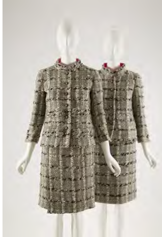
(L) Suit by Gabrielle Chanel, 1966, France. (R) Licensed copy of a Chanel day suit, c. 1967, USA.