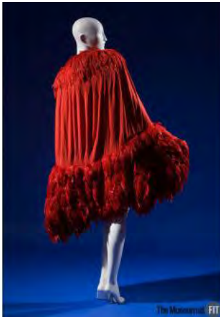
Gabrielle Chanel, evening cape, 1927, France.

The development of the haute couture transformed women's fashion from an artisanal craft into big business and high art. In the late 19th century, Charles Frederick Worth praised his American clients, saying they had "the faces, the figures, and the francs." Among his dresses on display is the famous "Electric Light Dress" worn by New York's Mrs. Cornelius Vanderbilt II. After World War II, the haute couture entered a new golden age from 1947 to 1957 and, by the 1980s, the haute couture was recognized as part of the unique patrimony of France.