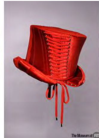
Christian Dior (Stephen Jones), top hat, fall 2000, France.

In today's era of globalization, foreign designers often choose to show their collections in Paris, home to luxury conglomerates such as LVMH and Kering. In a world with many fashion cities, Paris defends its title of world capital of fashion by producing and maintaining the aura of Paris fashion.