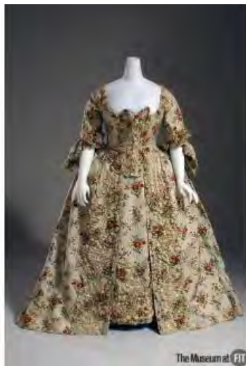
Robe à la française , 1755–1760, France.

Curated by Dr. Valerie Steele, director of The Museum at FIT, it will feature approximately 100 objects, dating from the 18th century to the present. The exhibition will be accompanied by a scholarly book, Paris, Capital of Fashion (Bloomsbury, 2019), edited by Steele, who is also the author of Paris Fashion: A Cultural History . In addition, there will be a free symposium on October 18, 2019.