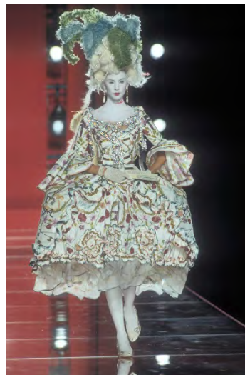
Christian Dior (John Galliano) haute couture, fall/winter, 2000-2001.

Paris, Capital of Fashion opens with an introductory gallery that places Paris within a global context, presenting it in dialogue with other fashion capitals, especially New York. By presenting an original couture suit by Chanel together with a virtually identical licensed copy sold by Orbach’s department store, for example, the exhibition demonstrates how the idea of Paris fashion “works” across fashion