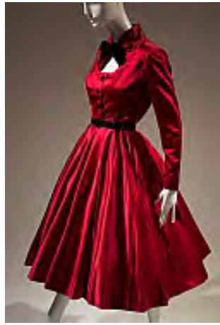
Jacques Fath for Joseph Halpert, cocktail dress, 1952, USA.