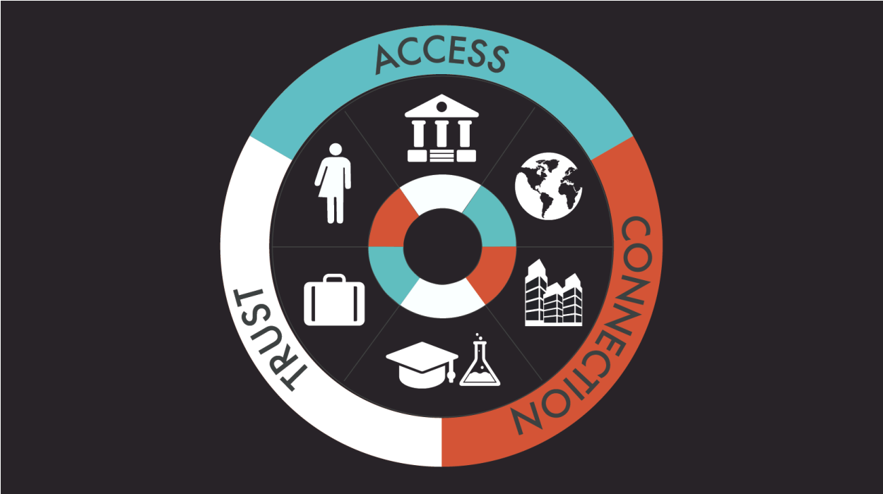
Exhibit A: The Innovation Ecosystem